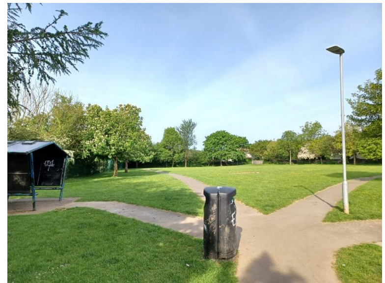
Youth shelter, pathways and amenity grassland/park