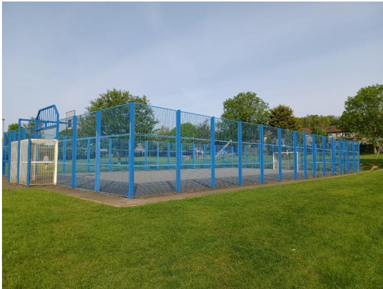
Multi-Use Games Area