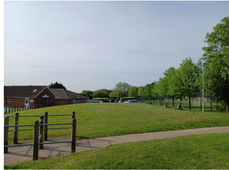
Proposed area for pump track (taken from the north of the area, facing south)