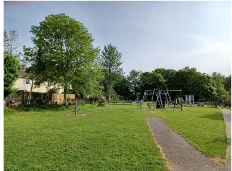
Unfenced play equipment