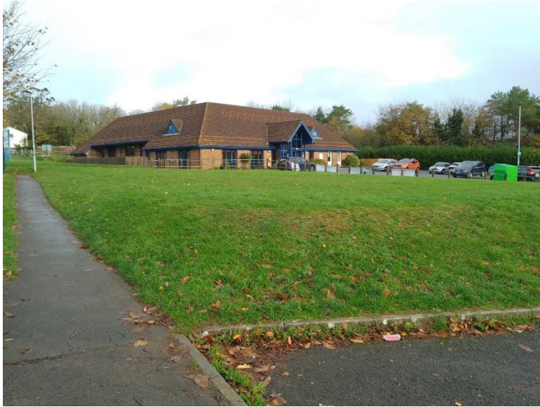
Proposed area for pump track (taken from the south of the area, facing north/north-east)