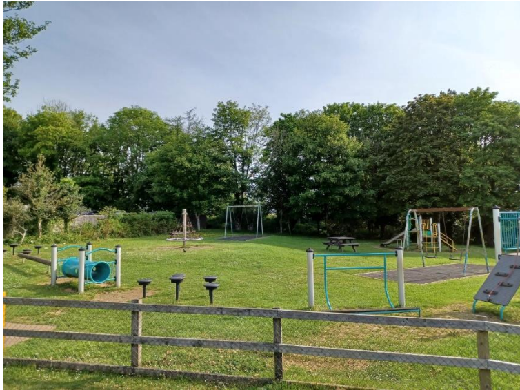
Fenced play equipment